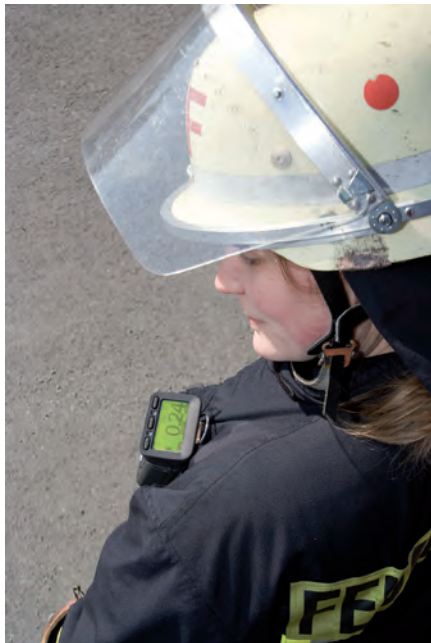
Reversible display always visible

tions, so working life and maintenance requirements are minimized. This gives the user far lower servicing and operating costs.