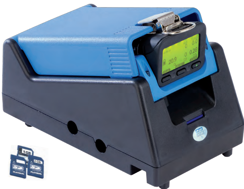
SD-cards: permanent data-logging for up to 45 years

The standard integrated memory records gas concentrations and alarms detected at a 1 minute interval for 30 hours. This storage capacity can be significantly increased by inserting an SD-memory card, which at a data-logging interval of 1 minute can store data for up to 45 years! Therefore, for the first time, a lifetime of worker's exposure data can be stored on one instrument.