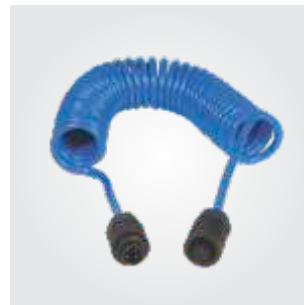
Cen-Stat cable supplied with male and female In-Line Quick-Connects.

The spiral cable provides effective retractability when the clamp is not in use, ensuring the cable is neatly stowed and safely out of the way.