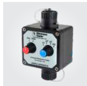
Universal Resistance Tester Product Code: URT.